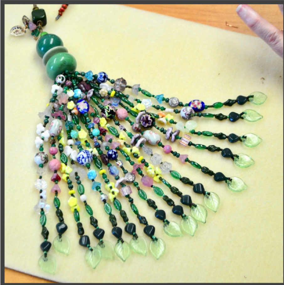
Some vintage (and classic ) Kate pieces!