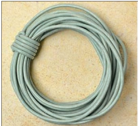
Pistachio 1.5 Indian Leather

Tierra Heishi in Bright Silver Full Lotus Charm in Silver 6-1251 Met. Matte Turquoise 6/0 Seed Beads Little Shadows in Silver