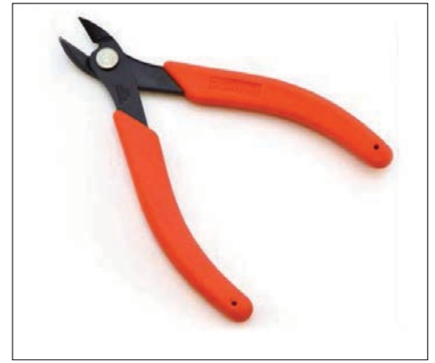
Xuron Maxi-Shear Flush Cutter