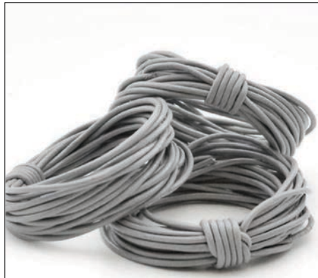
1.5mm Gray Indian Leather