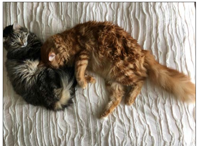
Sadie and Sammy doing what they do best....sleeping!