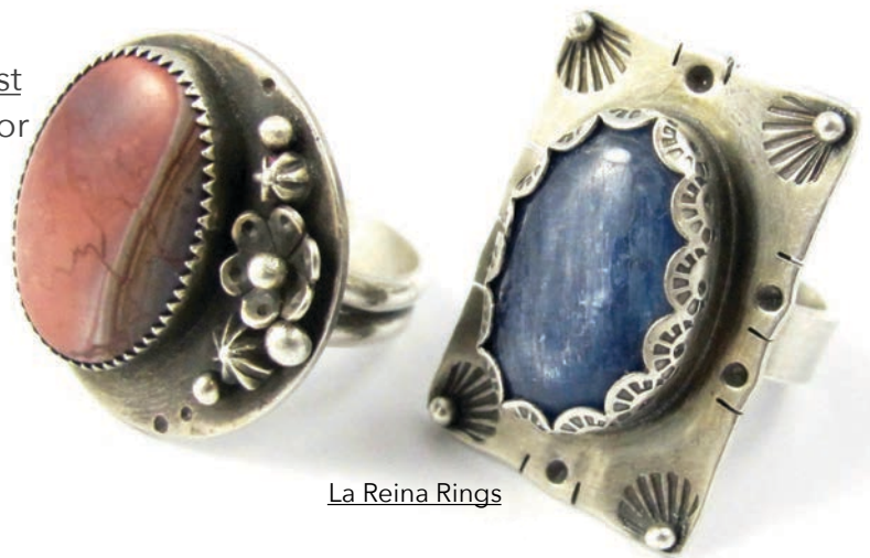
La Reina Rings