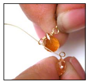
Step 11 Follow steps 1-10 to create another wirewrapped briolette. Before closing off the second loop, thread your previously wrapped briolette onto the wire.