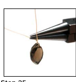
Step 25 Take your loop out of the top plier and put it in the bottom plier nose. Wrap the wire underneath the pliers.