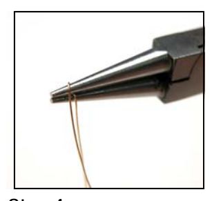
Step 4 With your fingers, take the short wire and bring it over the top plier nose.

pliers, twist your pliers so they are perpendicular with the ground and place the wire in between the plier noses.