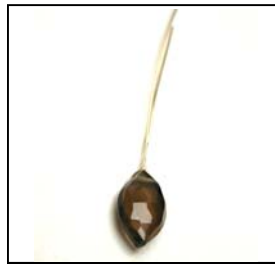
Step 20 With your fingers, fold both wires up around the top of the briolette.