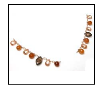
Step 14 Repeat steps 1-13 so you have an identical strand of 7 wire-wrapped briolettes.