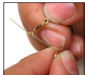
Step 15 Slide the last link of chain onto the loop on one of your briolette strands.