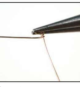
Step 8 Wrap your wire 3 times around the longer wire, starting from the bottom of the loop. Trim the excess wire from the wrap.