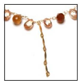
Step 18 Follow steps 15-16, wrapping your other strand onto the same chain link.