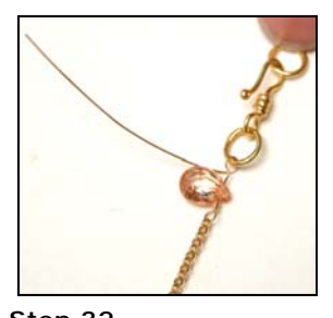
Step 32 Repeat steps 1-8 to add a clasp to your chain. Remember, before closing the loop, thread one side into the chain and the other into the jump ring or clasp. Do this on both chains.