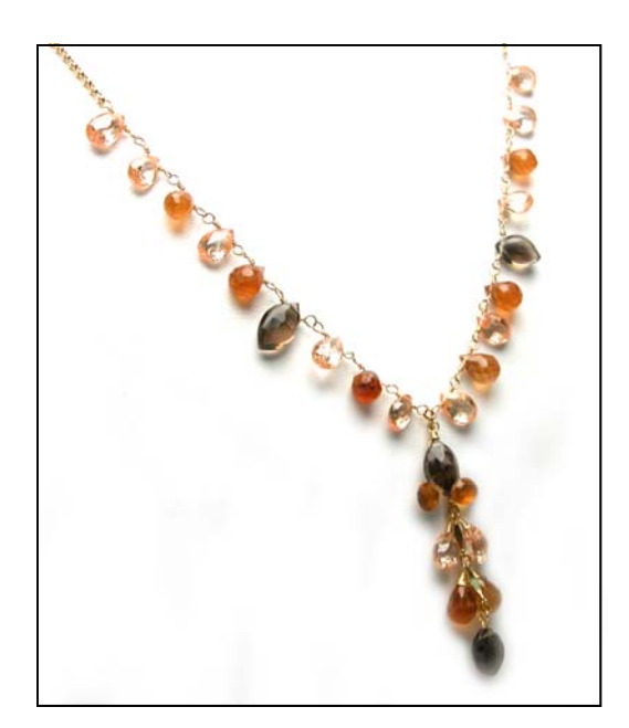
Congratulations! You have completed a beautifully designed briolette wrap necklace!