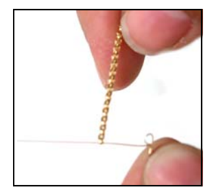
Step 29 Slide a piece of 6-inch (depending on the total length of the necklace) chain onto one of the unclosed loops on the briolette strand.