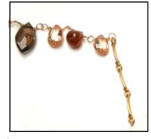
Step 17 The chain should look like this at the end of your wire-wrapped briolette strand.