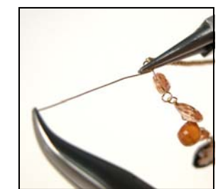
Step 30 Hold the loop with your round-nose pliers and wrap 3 times. Cut off any extra wire.