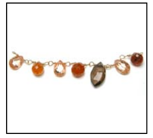
Step 13 Follow steps 1-12 until you have a strand of 7 wire-wrapped briolettes. Keep the wraps on both sides unwrapped