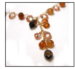
Step 28 Repeat steps 19-27, adding your briolettes to the chain. We added 2 on each link, and only 1 to the bottom link.