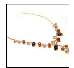
Step 31 Repeat steps 29-30 to add chain to the other end of your wirewrapped briolette strand.