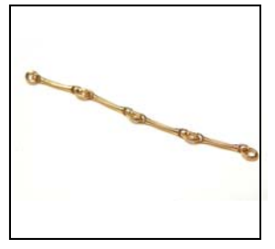
Step 14 Cut a piece of chain about 2-3 inches long.