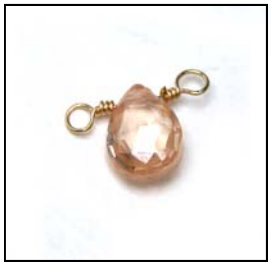
Step 10 Follow steps 1-8 on the other side of your briolette.