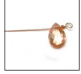
Step 9 Slide on one of your briolette gemstones.