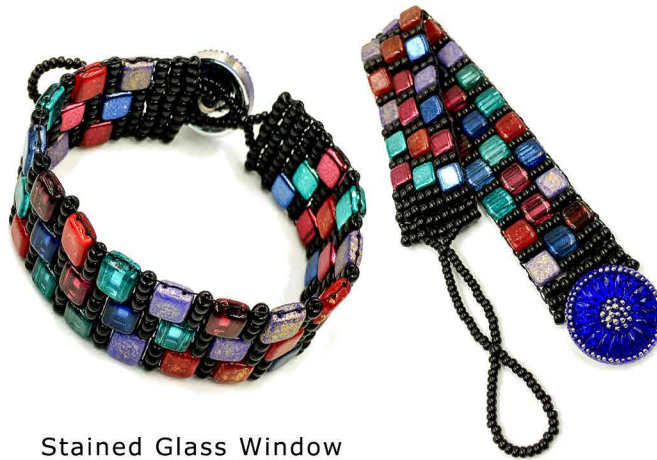
Stained Glass Window

The idea for this design began when I laid out all the materials. The bugles caught my eye and reminded me of decorative bamboo mats or the wall hanging at my local yoga studio. I recalled how the bugles were stitched in "Heart on My Sleeve" and the design fell into place.