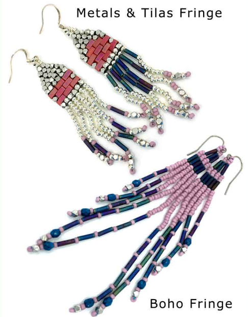
Metals & Tilas Fringe

This design actually started out as a variation of peyote stitch but just didn't work out. I set it aside for a bit while I finished other pieces. After trying again with the loom, I was quite happy with the result.