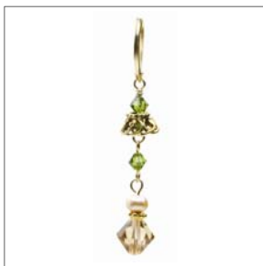
The central dangle contains three sections.