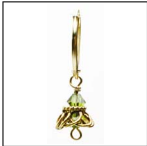
This is Section 1 of the central dangle.