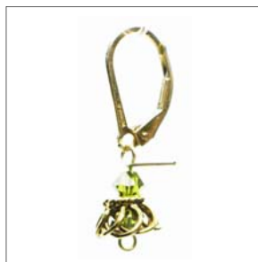
Step 4 Insert the lever-back ear finding.