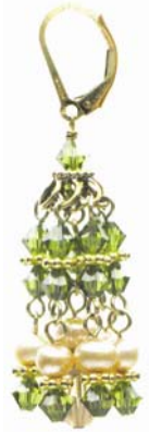
The Uffizi Olivine crystals, gold-filled and freshwater pearls.

2 8mm Swarovski bicone crystal in contrasting color