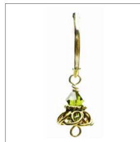
Step 5 Finish the wire-wrapped loop to secure the beads and cap to the ear wire.