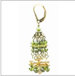
The chandelier earring.