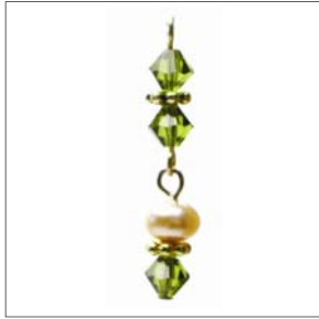
One of the six identical dangles.