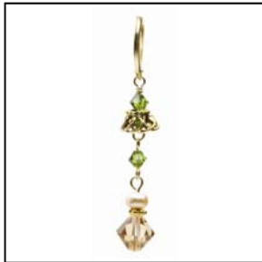
The central dangle contains three sections.