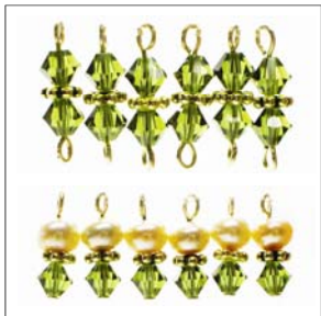
Components of the six identical dangles.