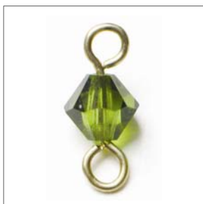
This is Section 2 of the central dangle.