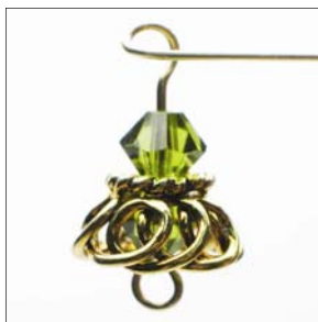
Step 3 Using the bent-nose chain pliers, open the loop slightly (out of its flat plane ).