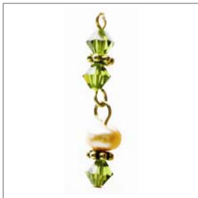
One of the six dangles that surrounds the central dangle.