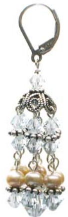
The Windsor Light Azore crystals, sterling silver and freshwater pearls.