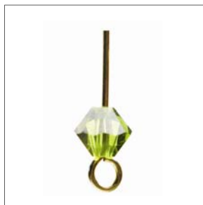
Step 7 Add one crystal.