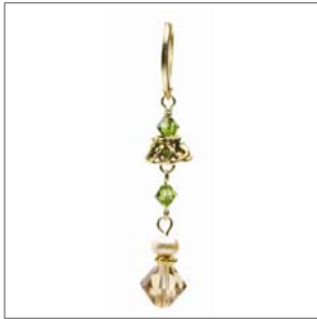
The central dangle contains three sections.