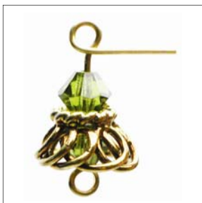
Step 2 Using the round-nose pliers, make a partial wire-wrap loop.