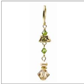
The central dangle hooked together.