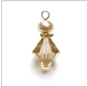
This is Section 3 of the central dangle.