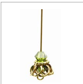
Step 1 Begin with a 2" eye pin. Slide one 4mm crystal and bead cap on to the eye pin. Add a second crystal.

We will be working on one earring at a time. When you have finished the first earring, come back to Step 1 to make the second.