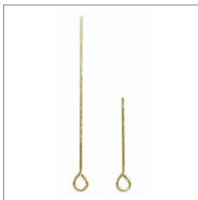
Step 6 Use the wire cutter to remove 5/16" of the 1" eye pin.