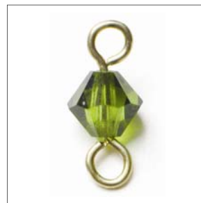
Step 8 Use round-nose pliers to finish end of the eye pin with a rosary loop.