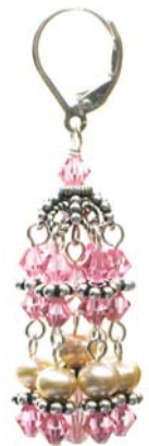
The Plaza Rose crystals, sterling silver and freshwater pearls.