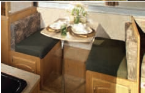
DINETTE (above) converts easily for overnight accommodations.