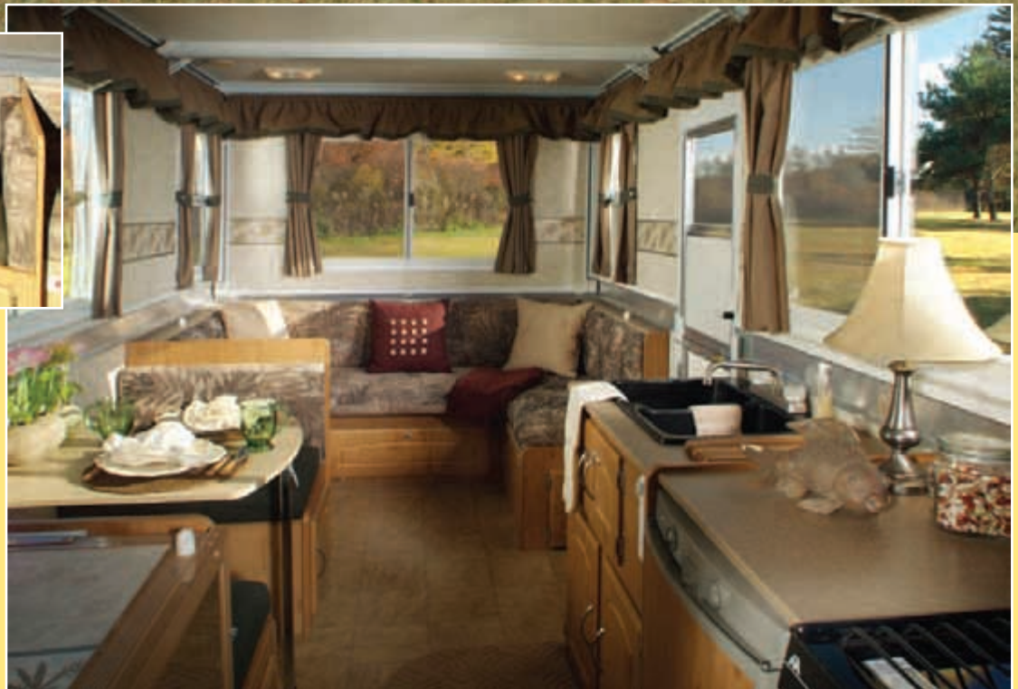
SPACIOUS INTERIOR includes a complete indoor bathroom (left) with solid wall shower and flushable ceramic commode. RESIDENTIAL STYLE GALLEY features double bowl sink, stove, oven, refrigerator and plenty of storage.