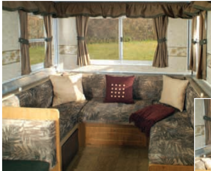
SPACIOUS AND COMFORTABLE SEATING AREA (Above and right) Converts easily for overnight accommodations.