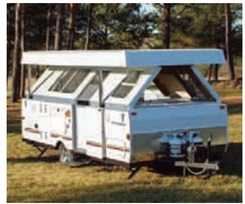
POWER LIFT SYSTEM (Above) Standard power-lift system makes set-up quick and easy.