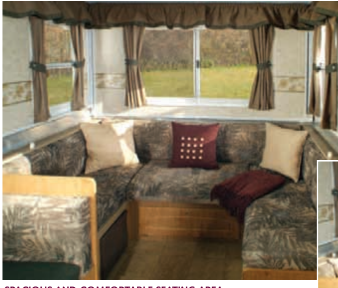
SPACIOUS AND COMFORTABLE SEATING AREA (Above and right) Converts easily for overnight accommodations.