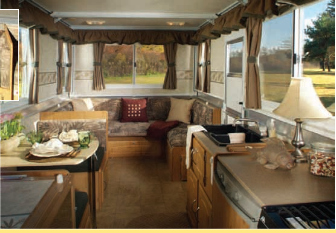
SPACIOUS INTERIOR includes a complete indoor bathroom (left) with solid wall shower and flushable ceramic commode. RESIDENTIAL STYLE GALLEY features double bowl sink, stove, oven, refrigerator and plenty of storage.