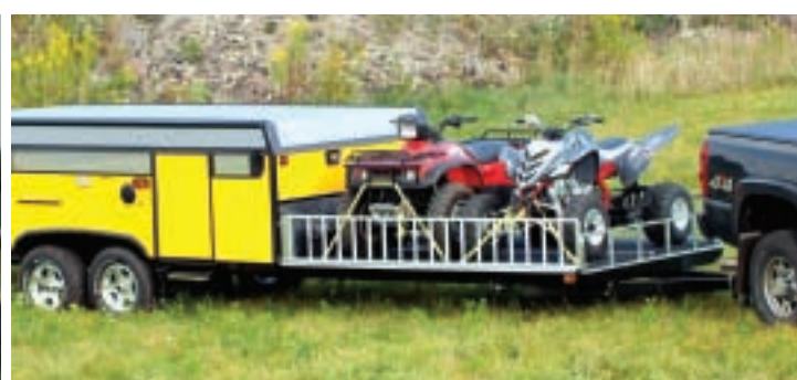
NEW FOR 2008 (above left) standard high-pressure outside stove for easy outdoor cooking. E4 DECK WITH INTEGRATED RAMPS AND RAILS (below) Illustration purposes only. Consult Owners Packet for proper loading and unloading information.