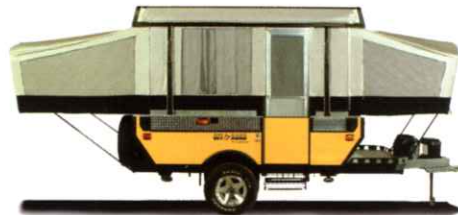
Mojave shown in "You Want a Piece of Me Yellow" exterior.