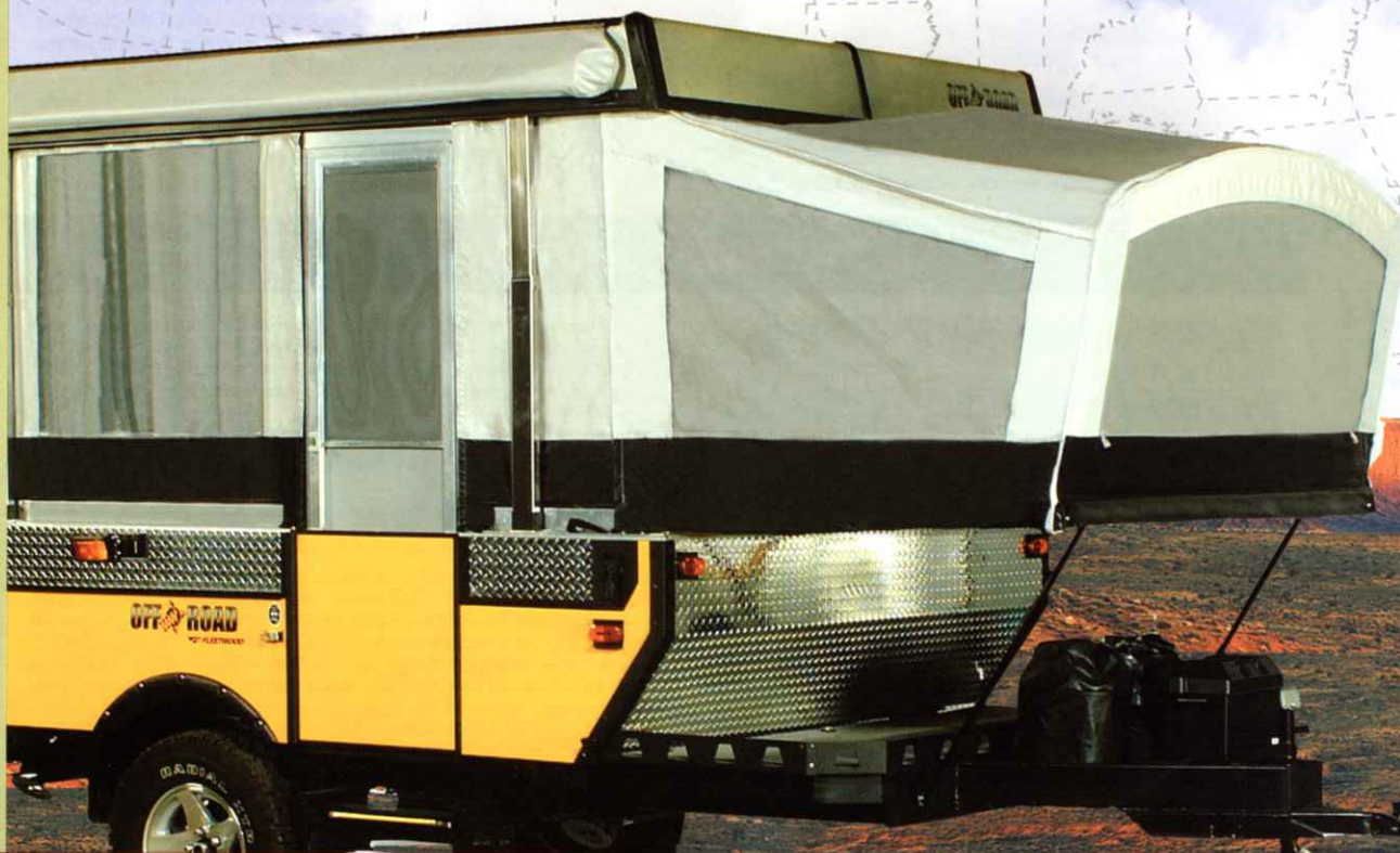
Photography shows an optional canopy, vinyl gas bottle covers and battery box.