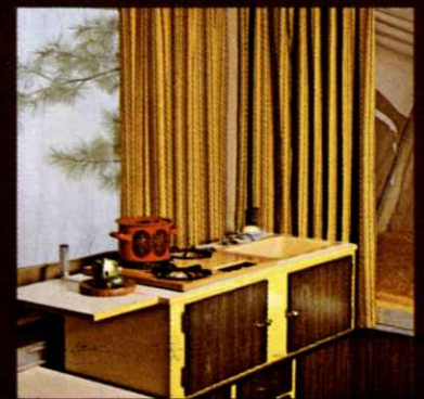
Draperies and privacy curtains—practical, cheerful, color-coordinated.

COLORS—blended so fabrics, floor coverings, counter tops, sink and range ensemble all complement each other. Color coordinated draperies add just the right touch for the homemaker.