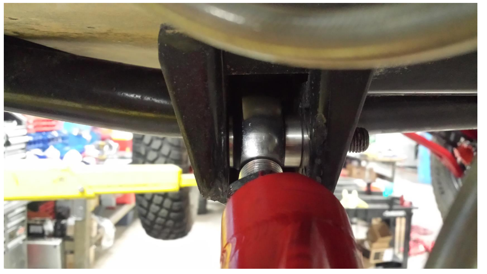
Use this configuration if your ride height is less than 15.5" Small spacer on outside and large spacer on inside.