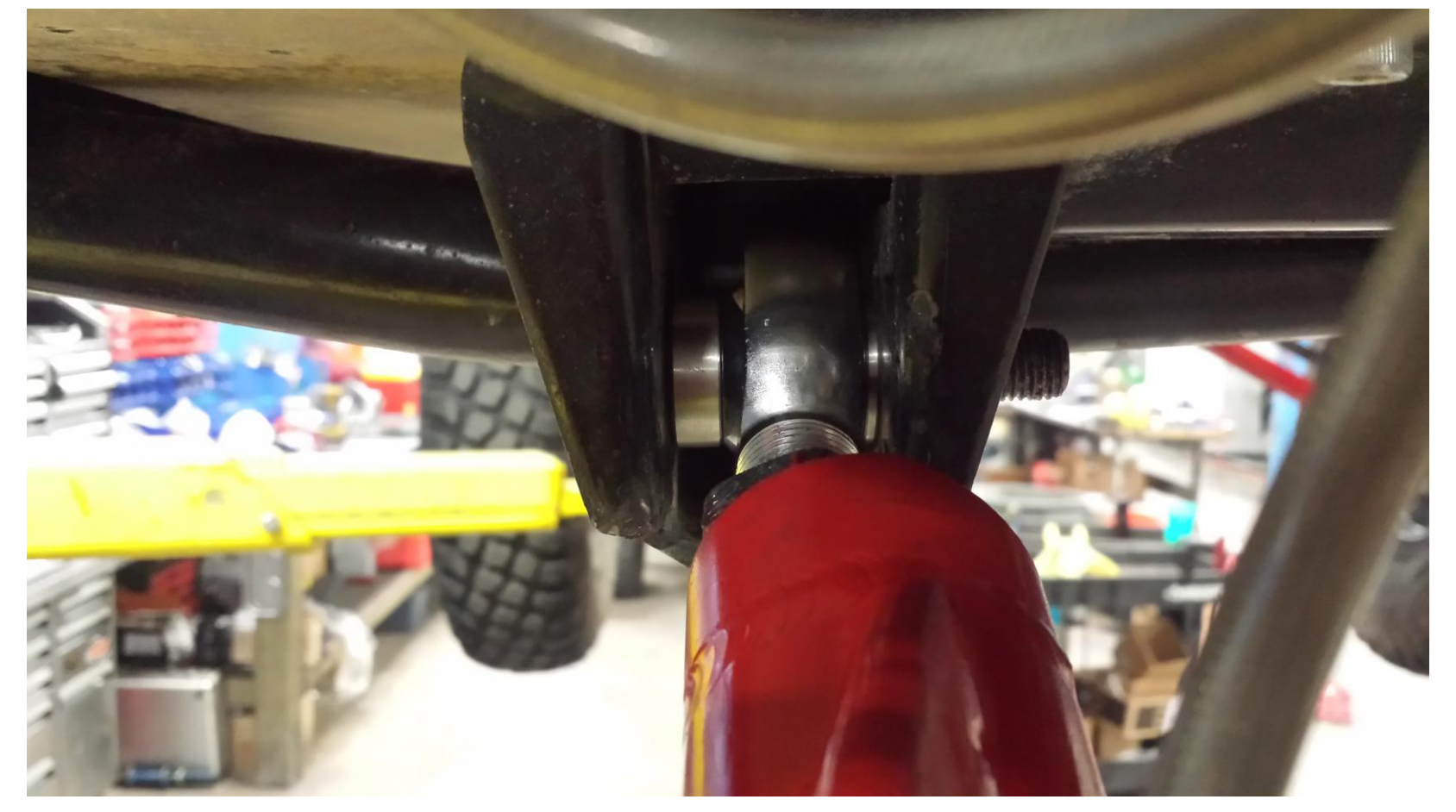
Use this configuration if your ride height is more than 18" Large spacer on outside and small spacer on inside.