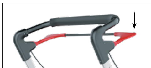
Safety brake control bar with wide handle