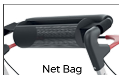
Accessory bag for utensils such as medicines and cosmetics