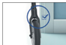
Integrated wheel fork