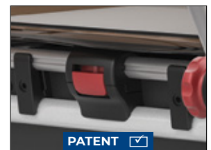
Innovative "Click & Safe" safety catch