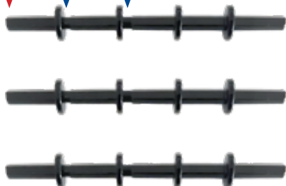
3×MULTIPLE PLY STANDOFFS ←See Cutting Guide