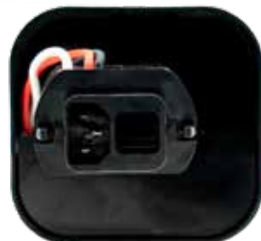
HUB B - OUTSIDE OUTLET