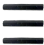
3×1 PLY STANDOFFS Do Not Cut!