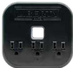
HUB A - INSIDE OUTLET