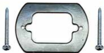
COVER PLATE & COVER PLATE SCREWS (1 3/4")