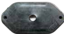
HOLE SAW CENTERING GUIDE