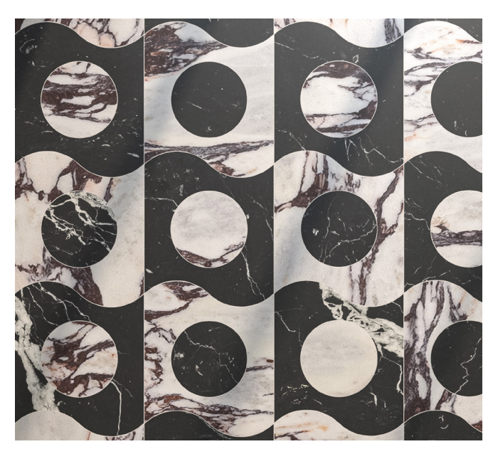
Shown here with \, Nero \, Marquina \, \& \, Calacatta \, Viola \, (\, cut \, from \, 12" \, x \, 24" \, Field \, Tile)