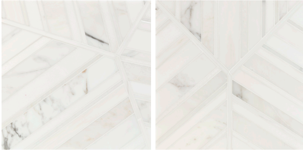
Bianco Polished Mosaic - Pacific White, Calacatta Gold, Bianco Dolomiti, and Thassos