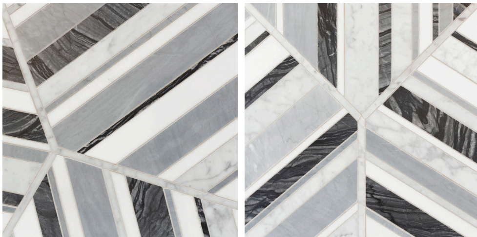
Nero Polished Mosaic - Bardiglio, Silverwave, Bianco Carrara, and Thassos