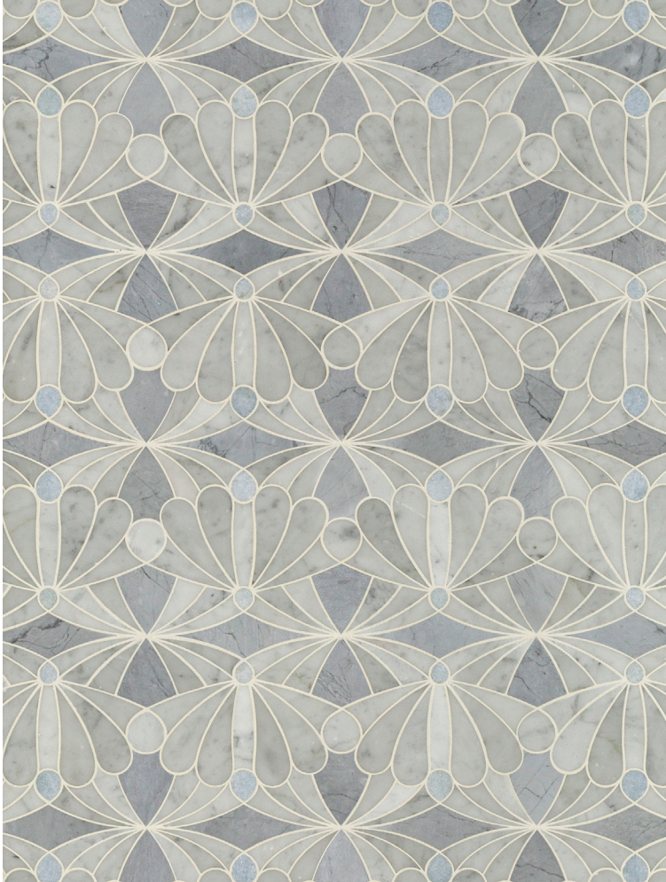
Grey - Bianco Carrara polished, Bardiglio polished & Azul Cielo polished