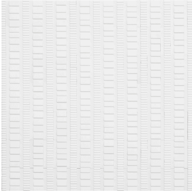
Thassos -Mixed Finish