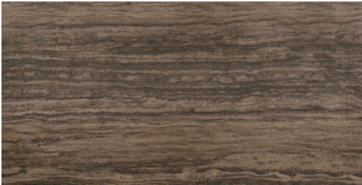
Brown Textured - Special Order Only