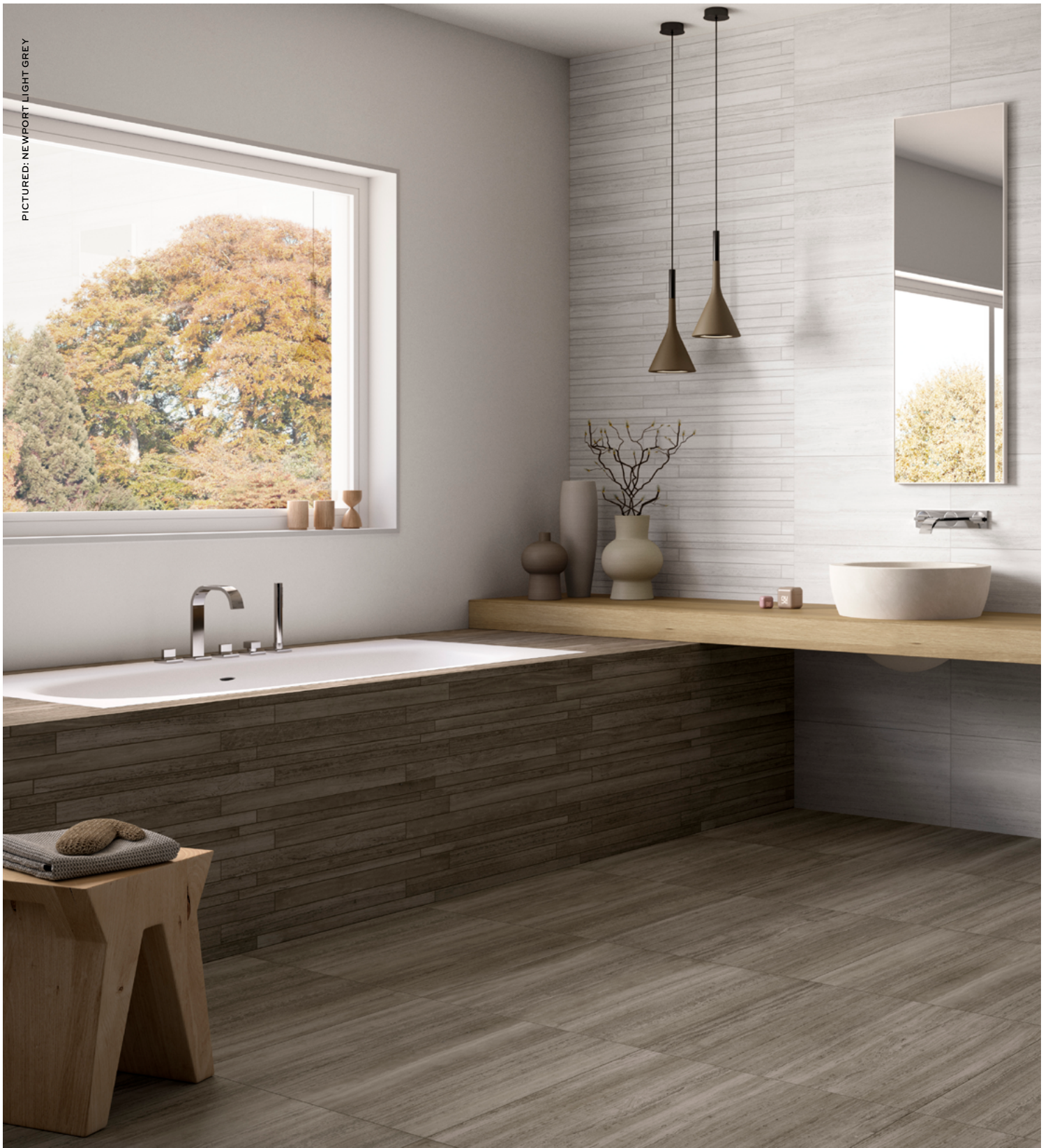
PICTURED: NEWPORT LIGHT GREY

Design in harmony is the inspiration for Newport. Beauty meets functionality in this stone porcelain abundant in movement and life. Distinct veining and a brushed finish give Newport the beauty of stone with the ease of porcelain.