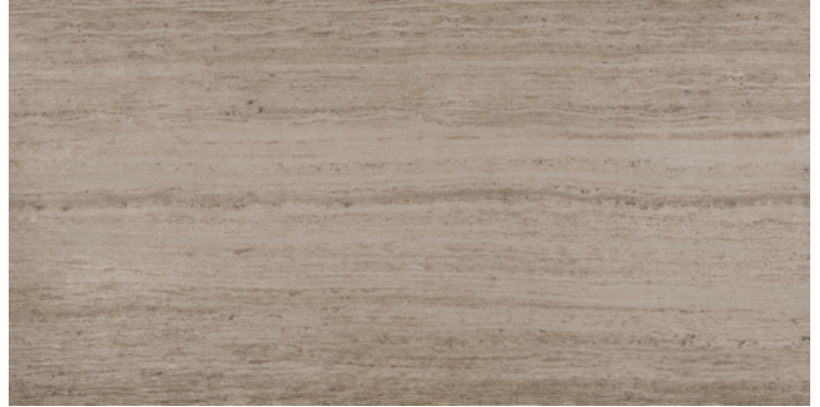
Light Grey Textured - Special Order Only