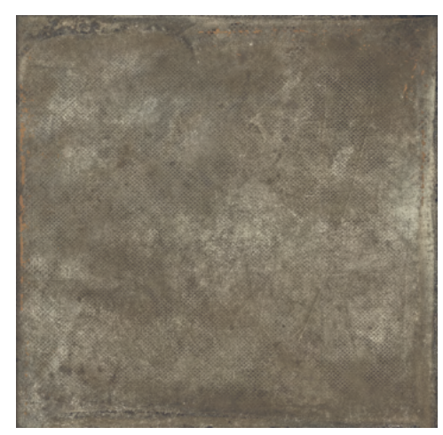
Fresco Brown - Matte