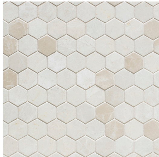
11 3/8" x 12 1/8" Hexagon Mosaic Polished