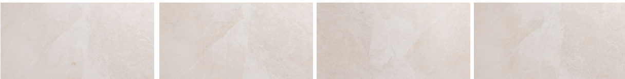
24" x 48" Field Tile Honed Finish