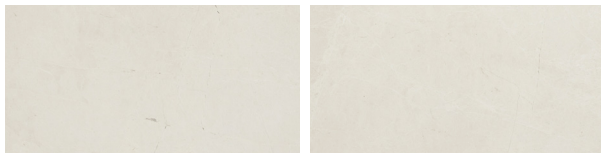
12" x 24" Field Tile Polished & Honed