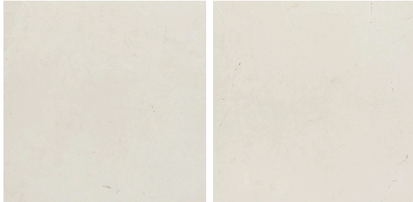
24" x 24" Field Tile Polished