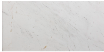
12 x 24" FIELD TILE Honed Finish