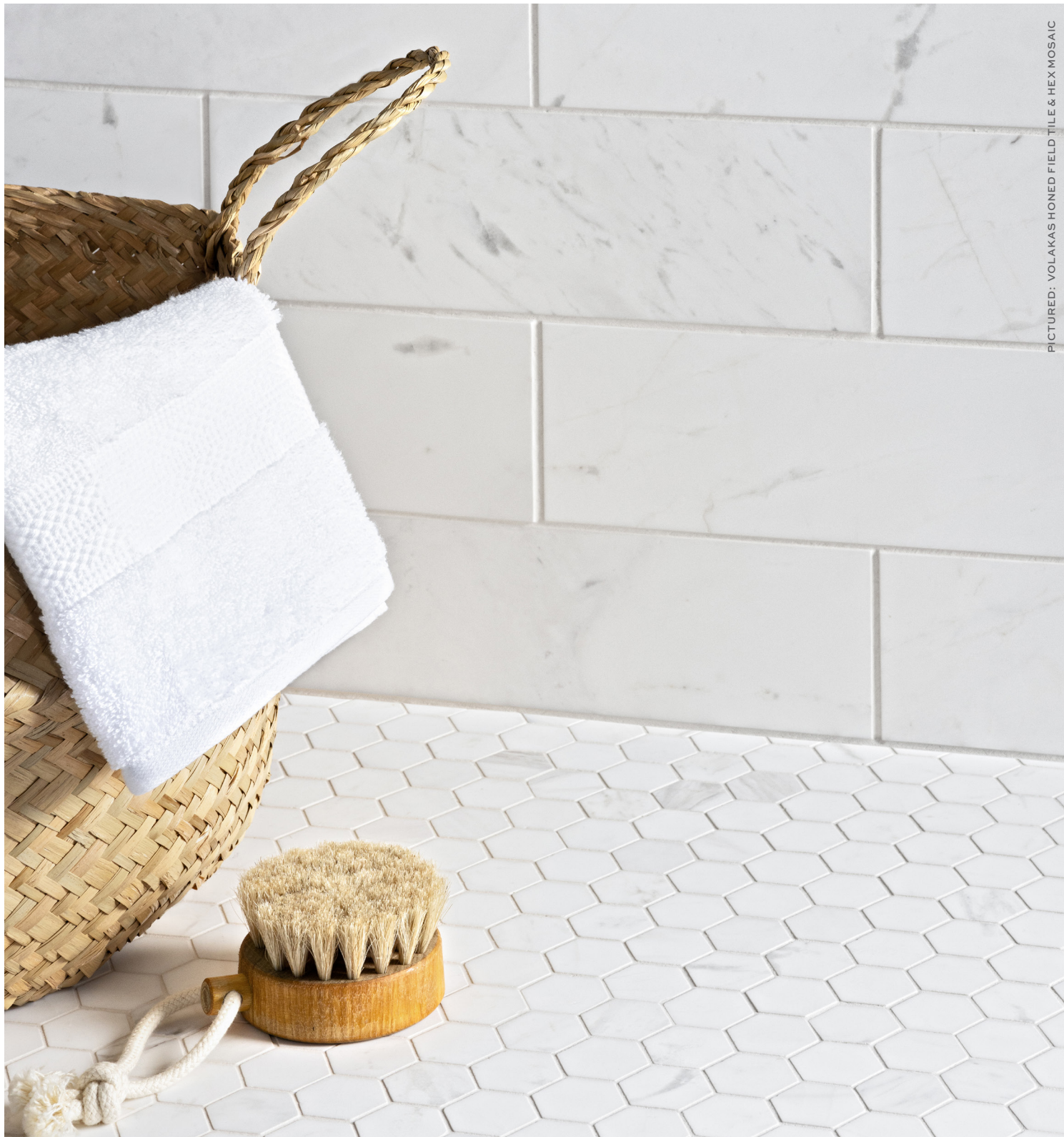
PICTURED: VOLAKAS HONED FIELD TILE & HEX MOSAIC

Named for a remote village on the outskirts of the Falakro mountains in Northern Greece, Volakas marble is one of the region's most well-known, and is sometimes referred to as "the Carrara of Greece." Its classic white background displays stripes of grey, taupe, and pale burgundy, giving the stone a natural intricacy and intriguing variety. Available in a variety of field tile formats, 3cm hexagon mosaics and 2cm bookmatch slabs, all honed.