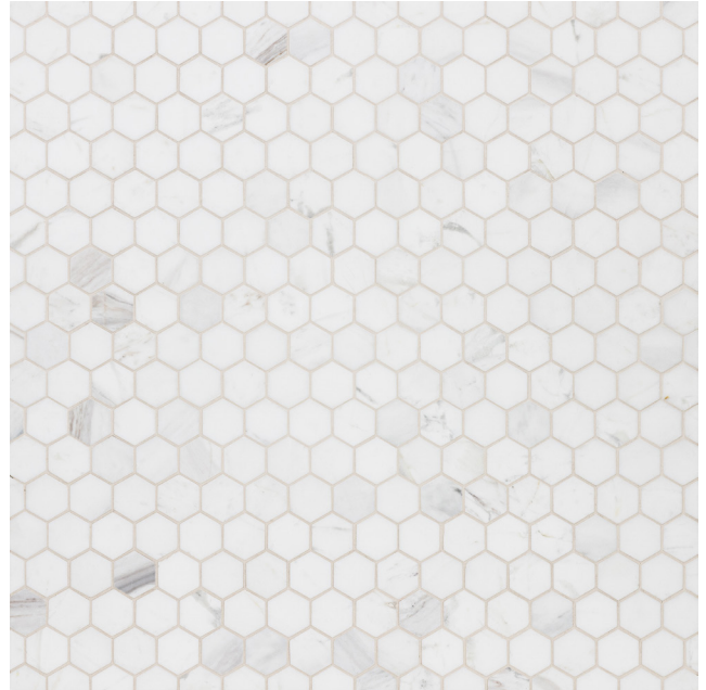
3CM HEXAGON MOSAIC Honed Finish