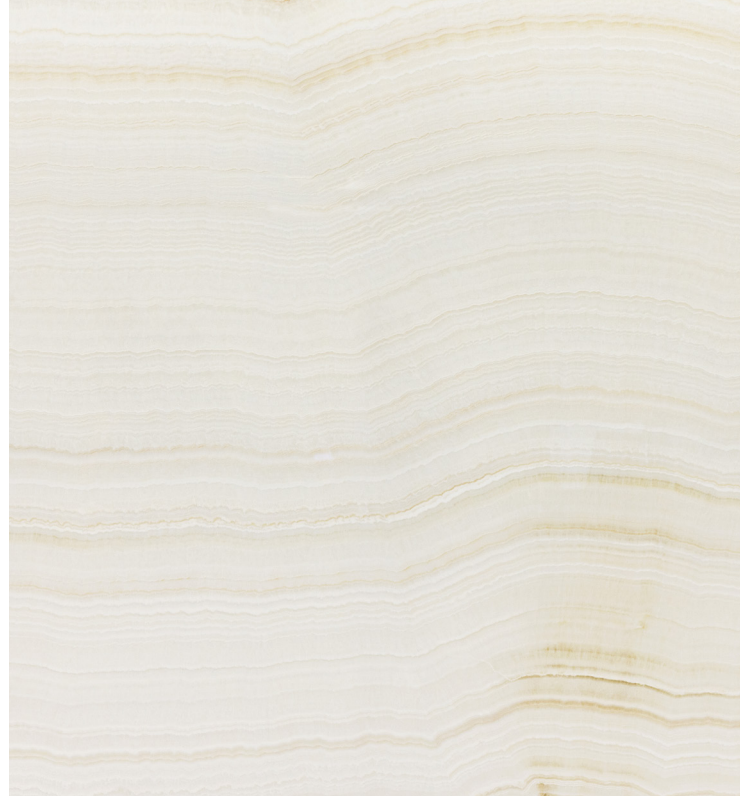
2cm Polished-extra vein