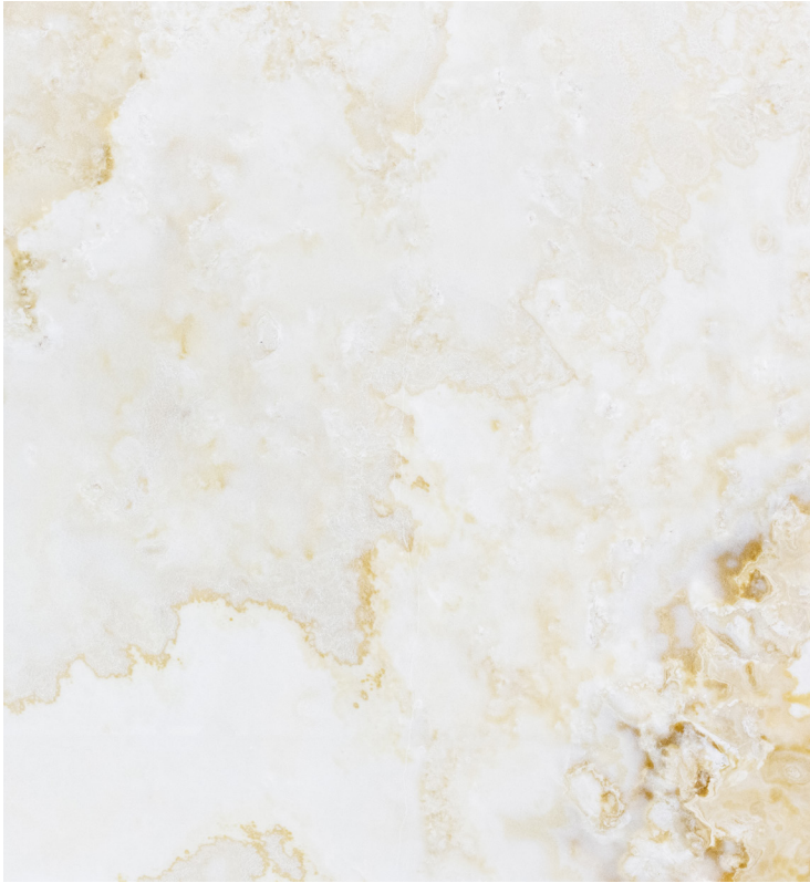
2cm Polished-cross cut

Vanilla Onyx brings a translucent, dreamy aspect to any project. Its exotic beauty evokes soft moonlight; making Onyx a desired element in jewelry for centuries. Dramatic yet serene, Vanilla Onyx is exquisite in any setting.