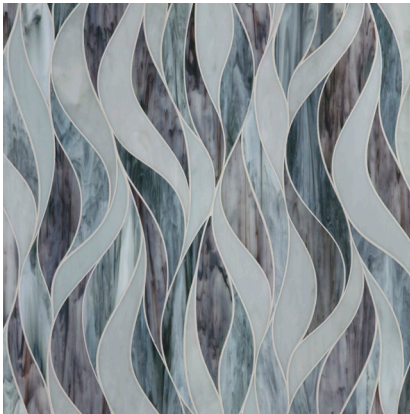
Blue Grey Gloss