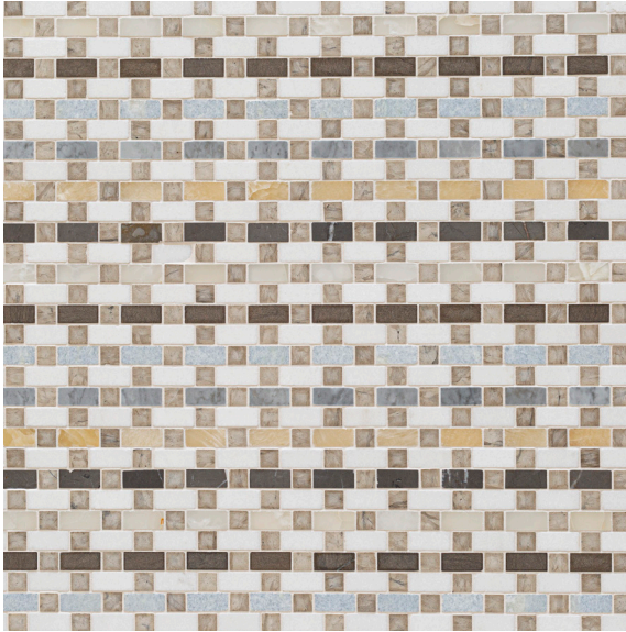
Thassos, Smoke, Sable Onyx, Bardiglio Imperiale, Azul Cielo, Grey Foussana, Bianco Onyx & Grafite