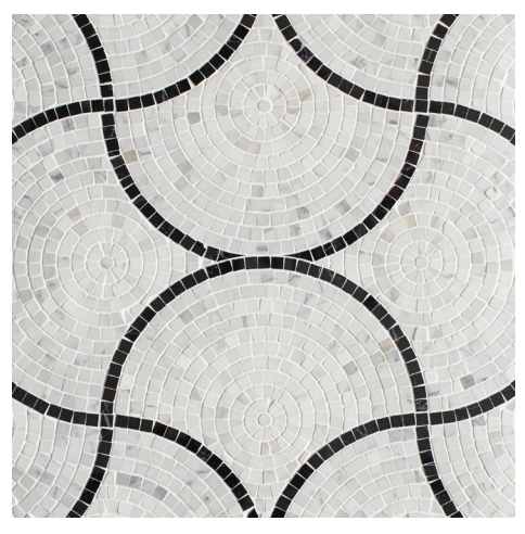
Statuary, China Black - Polished Special Order Only