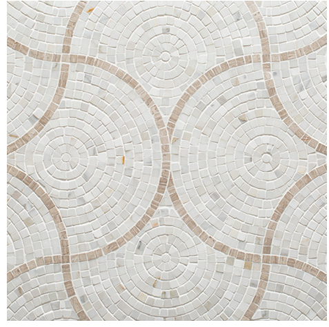
Calacatta Gold, Cloud - Mixed Finish