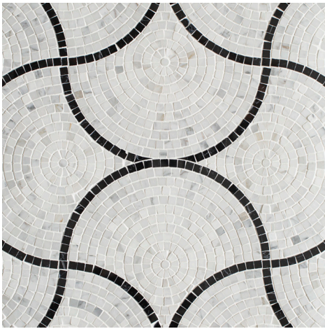
Statuary, China Black - Polished Special Order Only