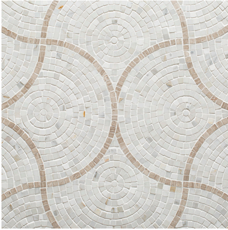
Calacatta Gold, Cloud - Mixed Finish