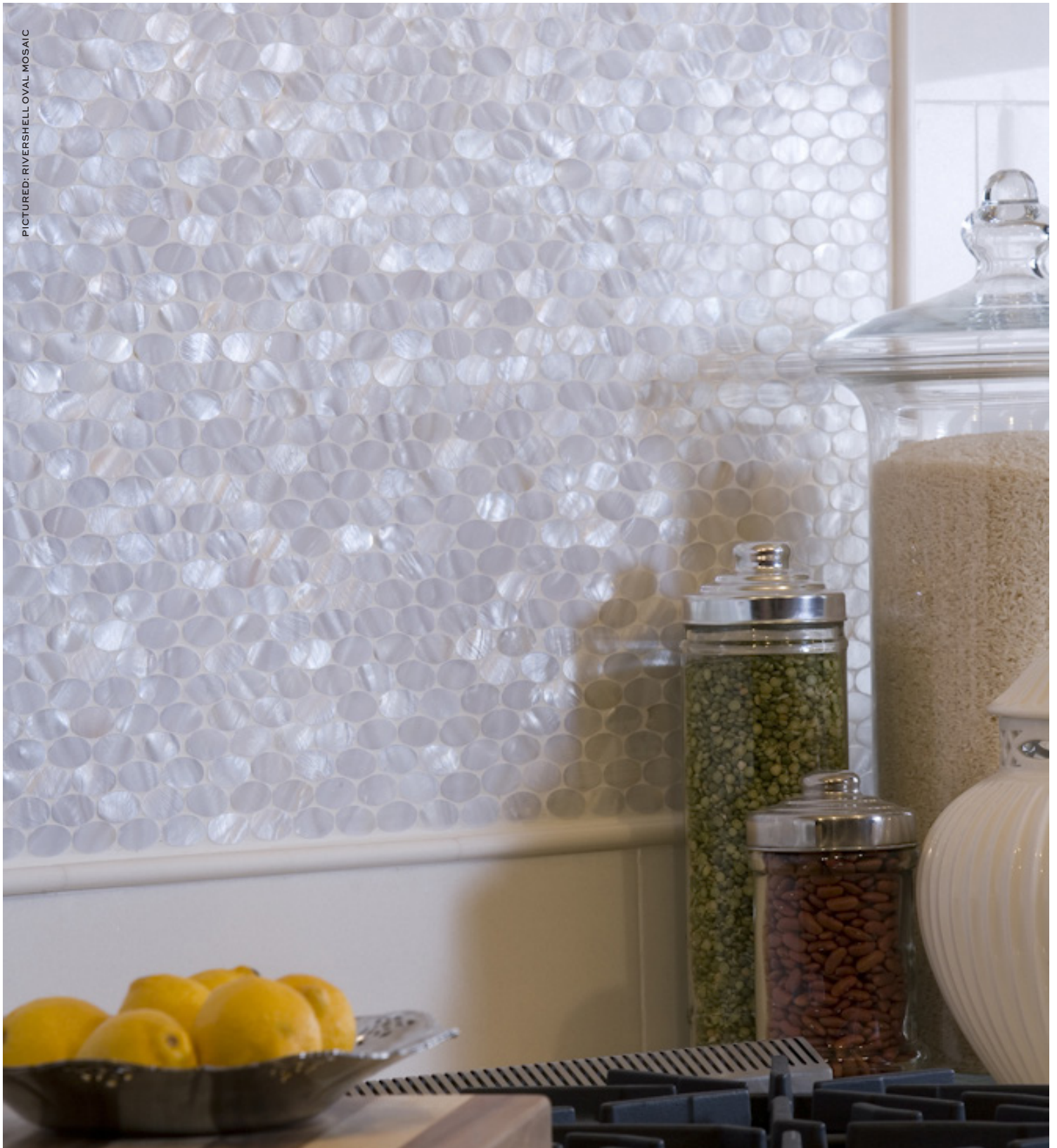
PICTURED: RIVERSHELL OVAL MOSAIC

Freshwater shells provide the Rivershell Collection with its pearly glow, for an ultra-luxe look made from natural renewables. Available as field tiles, liners and mosaics, Rivershell can also be added to our custom waterjet patterns for an extra touch of grace.