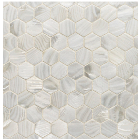
White Rivershell Hexagon Mosaic Polished