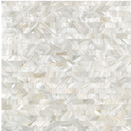
White Rivershell Field Tile Polished