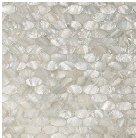
White Rivershell Oval Mosaic Polished