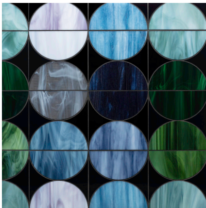
MOON DARK MULTI - MIXED FINISH Black, Charcoal, Denim Blue, Violet, Midnight Blue, Memphis Blue, Trumpet Turquoise