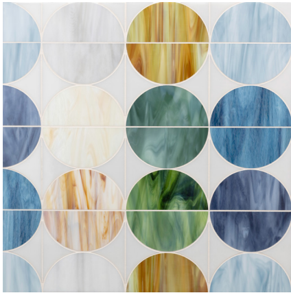
MOON LIGHT MULTI - GLOSS Translucent White, Memphis Blue, Trumpet Turquoise, Light Blue, Dark Green, Birdland Green, Light Green