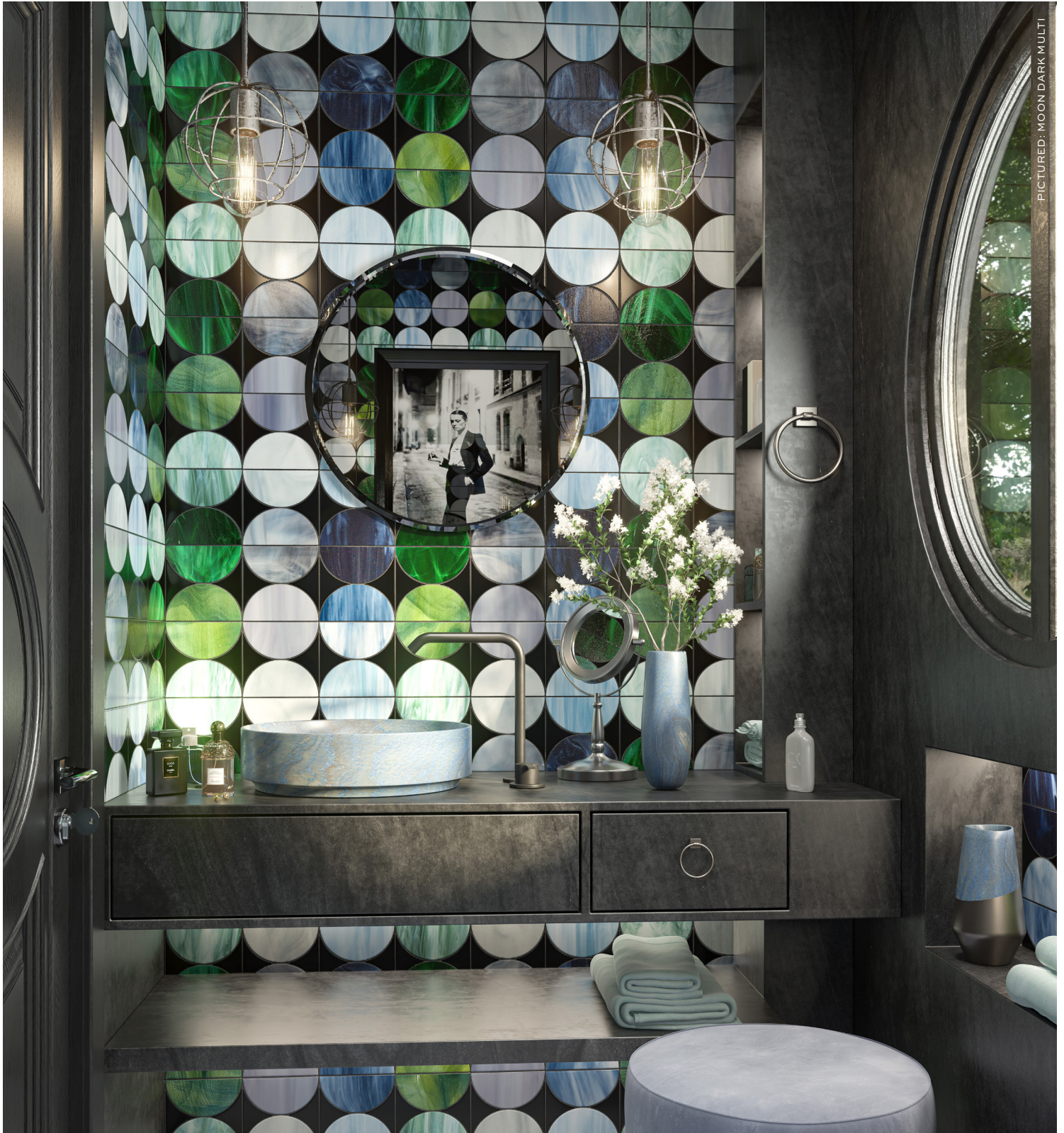
PICTURED: MOON DARK MULTI

A complex pattern of bisected circles crafted in vibrant, glowing Jazz Glass. Presented in Light Multi and Dark Multi options.