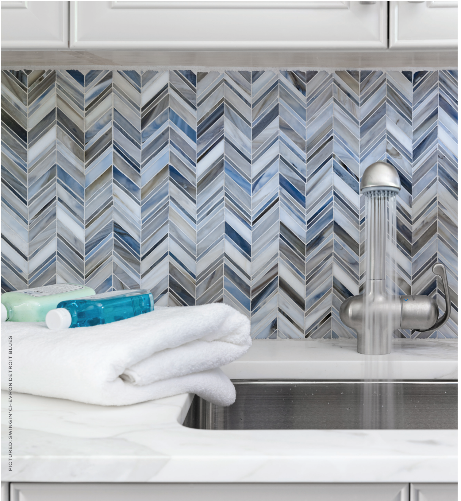
PICTURED: SWINGIN' CHEVRON DETROIT BLUES

Straight out of the jazz clubs of the roaring twenties, Swingin' Chevron struts and shakes its stuff in style! These hot little chevrons take a classic pattern and stuff it with pizzaz, shimmering in sultry Jazz Glass colors like Detroit Blues and Blue Blend.