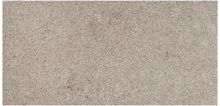
Taupe - Bush Hammered