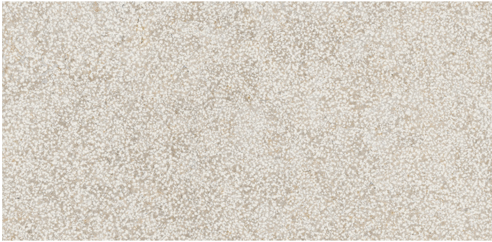
White - Bush Hammered