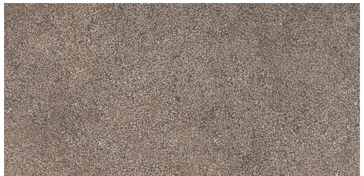
Brown - Bush Hammered