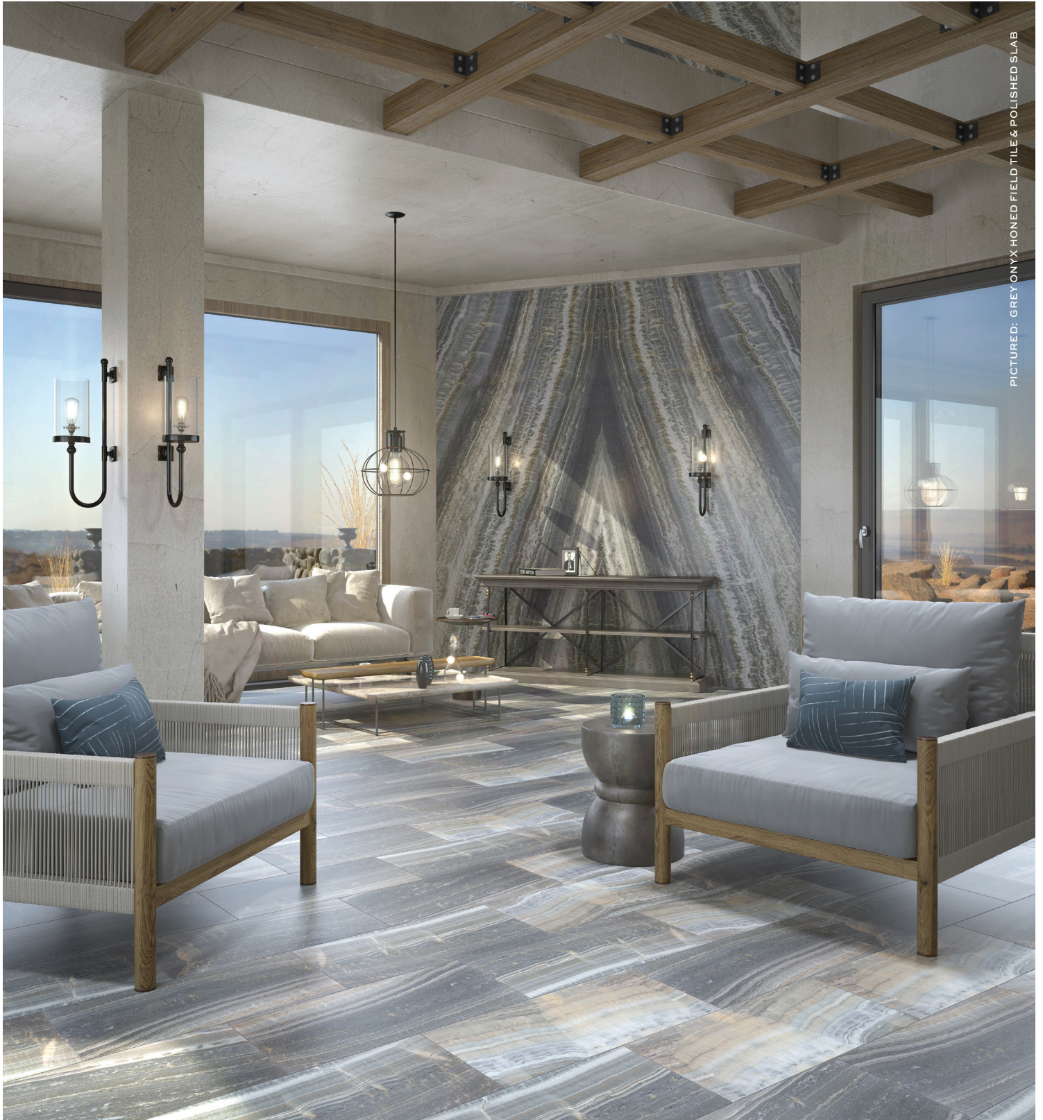
PICTURED: GREY ONYX HONED FIELD TILE & POLISHED SLAB

A majestic onyx, specially cut from the block to show off ribbons of rich, translucent color ranging from gold to silver to deep blue-grey. The interaction of warm and cool tones, and the inherent drama in the veining make this stone ideal for both vertical and horizontal use. Grey Onyx is stocked in 2cm, polished slabs and honed 12" × 24" field tile.