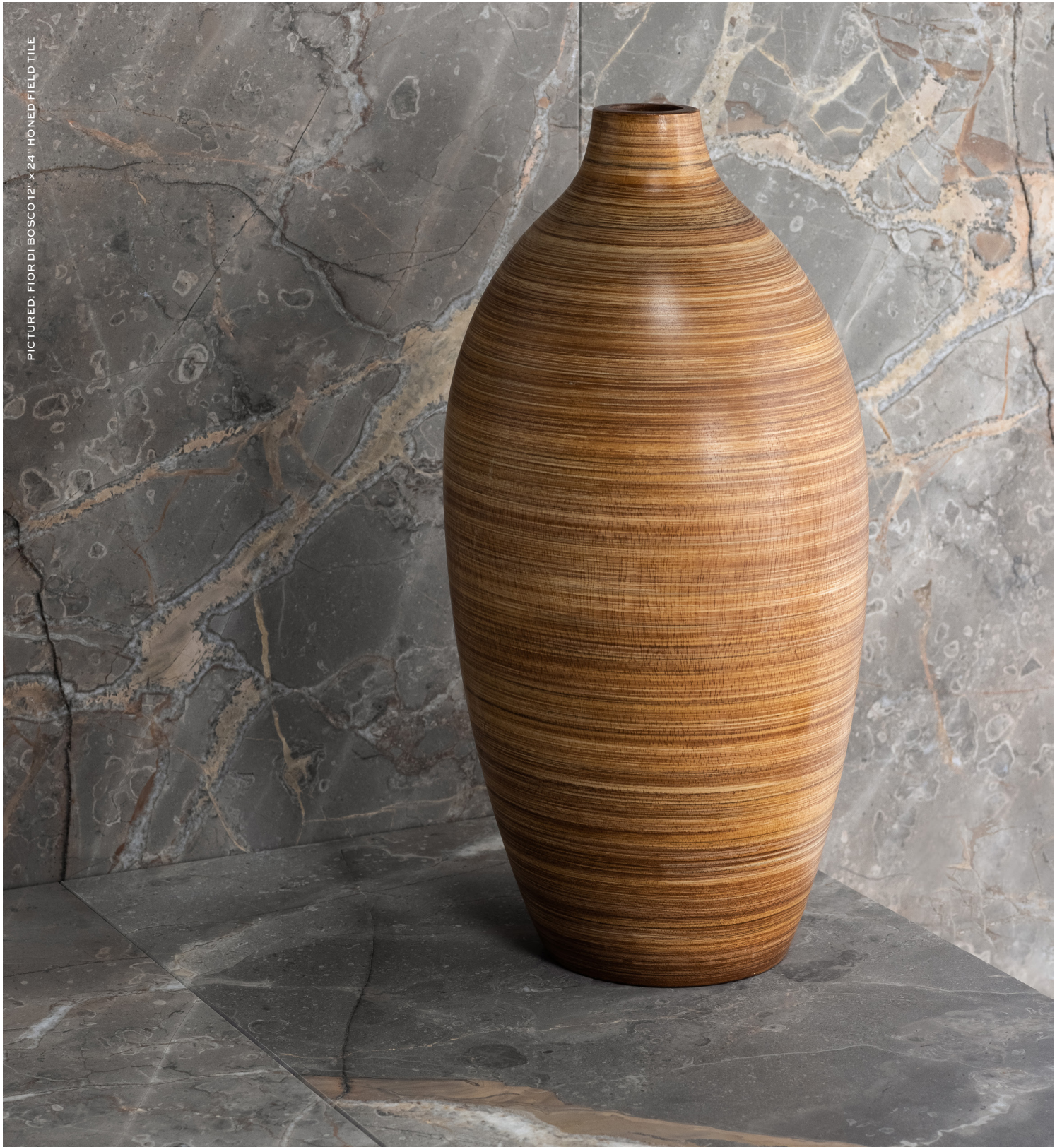
PICTURED: FIOR DI BOSCO 12" x 24" HONED FIELD TILE

This classic marble is named “wildflower” in Italian, and is sourced from Italy. Softly flowing infusions of warm apricot move across a ground of rich pearl grey, creating a surface redolent both of Art Deco and Mid-Century Modern design. The visual movement of the veining in this Tuscan marble is especially intriguing. Available in a ¾" (2cm) polished slab and 12" × 24" honed field tile.