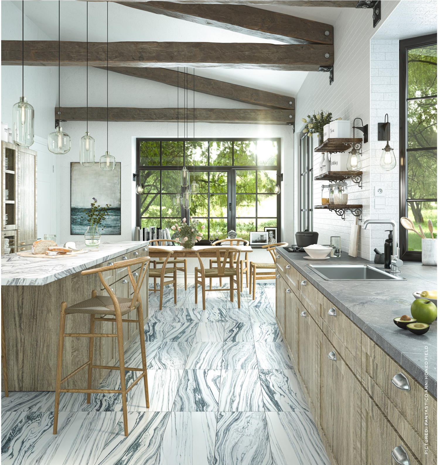
PICTURED: FANTASTICO ARNI HONED FIELD

Fantastico Arni is a striking Italian marble, sourced from the Apuan Alps of Tuscany, whose storied quarries represent the pinnacle of Italian stone. Against a fresh cream ground, dazzling veins strike sharp angles in a range of complementary colors, from vanilla and mauve through peach and rose to charcoal grey and deep rich green. The veins ebb and flow across the surface, rising and falling in extraordinary angles and swirls that recall both snowy mountain peaks and icy, rushing streams. A true 'statement stone.' Offered in 12" x 24" honed field tile and 2cm polished slabs, ideal for bookmatching.