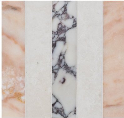
MULTI - Honed White Sand, Rosa Perlino, Turkish Viola, Spring Green