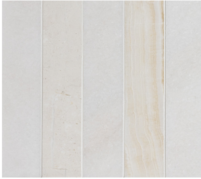
WHITE - Honed Thassos, Volakas, White Sand, Vanilla Onyx