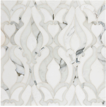
Thassos & Calacatta Gold