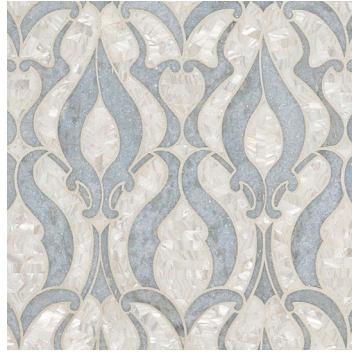
Azul Cielo & Shell