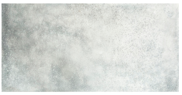
Straight Edge Antiqued Mirror Hand-Silvered - 12" × 24" × ¾" Custom sizes available based on maximum sheet size 72" × 130", thickness may vary. Rose Gloss available based on maximum sheet size 45" × 90" × ½,«"