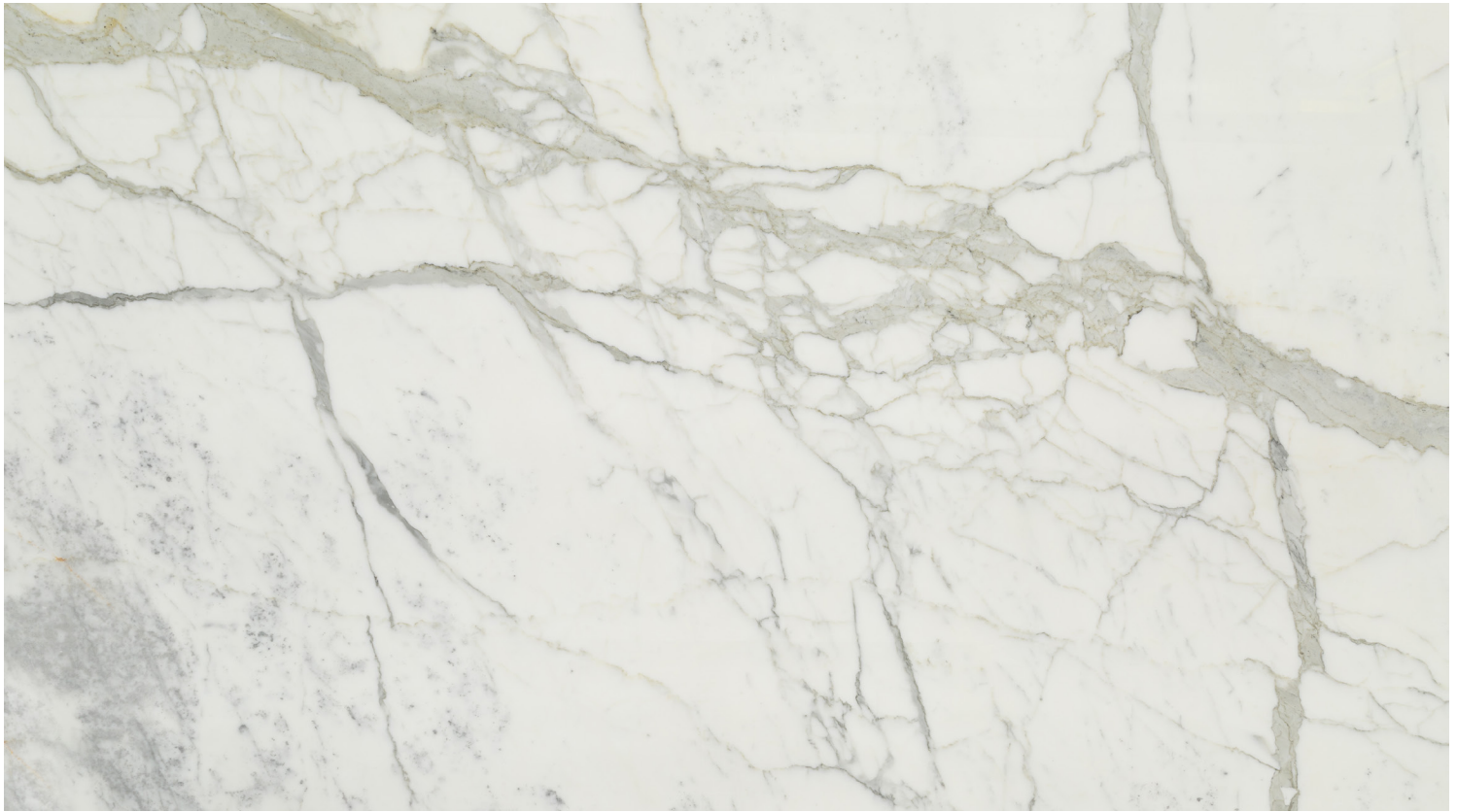
2cm & 3cm Polished

Call off the search! Artistic Tile's Calacatta Gold slabs are the quintessential classic Italian polished white marble. Our Calacatta Gold slabs are accented by soft grey and gold veining and are sourced for the highest quality. Stocked in a variety of thicknesses and price points, these slabs tend to move very quickly and are often difficult to source at the quality level we demand.