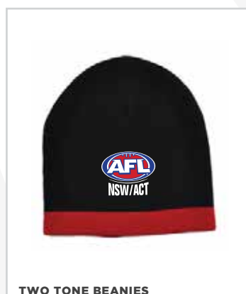
TWO TONE BEANIES