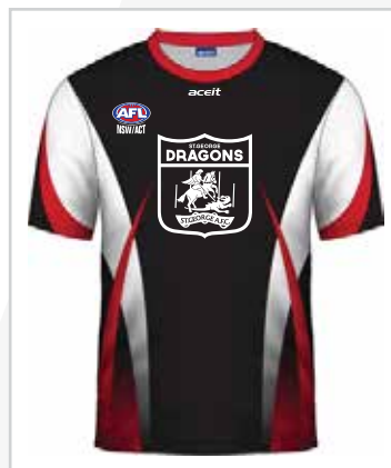
STYLE CODE T01