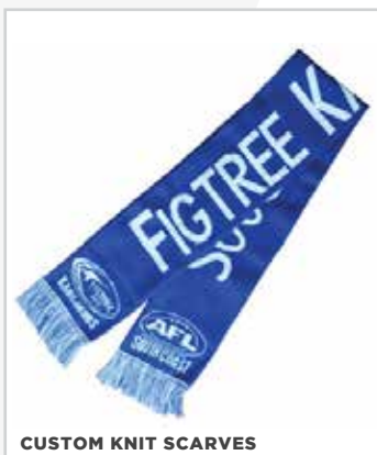
CUSTOM KNIT SCARVES