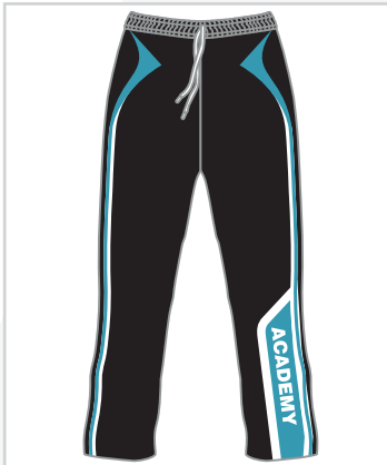
STYLE CODE 1004