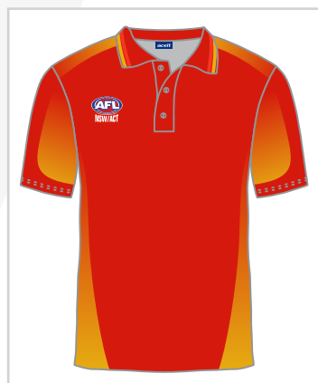
STYLE CODE 100