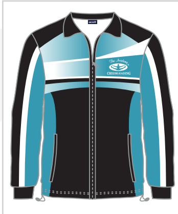
STYLE CODE 1005