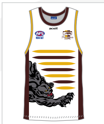
STYLE CODE TS600