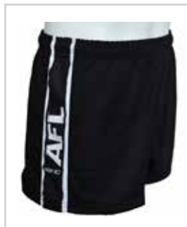
SIDE PANEL SUBLIMATED