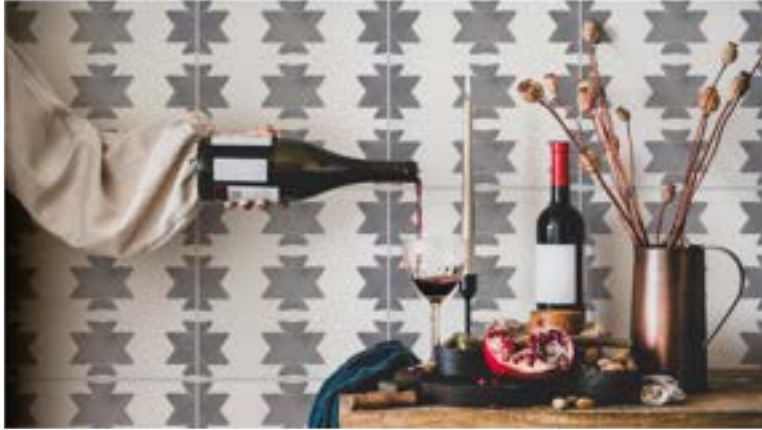
SERIES: SINGLE FLOWER

AVAILABLE SIZES & TILE BODIES: 12x12 POLAR ICE TERRAZZO CONTACT US FOR CURRENT LEAD TIMES