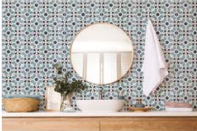
SERIES: BLOSSOM 1

AVAILABLE SIZES & TILE BODIES: 12x12 POLAR ICE TERRAZZO CONTACT US FOR CURRENT LEAD TIMES