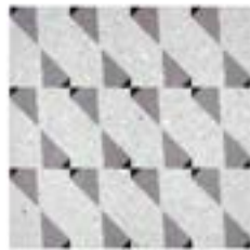
SALT AND PEPPER