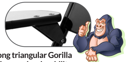
Ultra-strong triangular Gorilla bracket adds superior durability