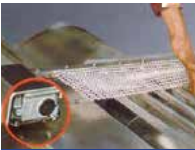
Safety Device (on hopper)