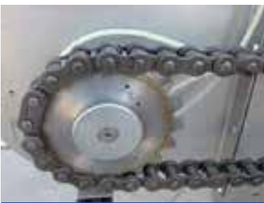
Bolt Auger Safety