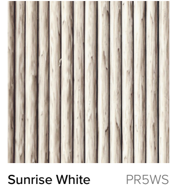
Sunrise White Shell