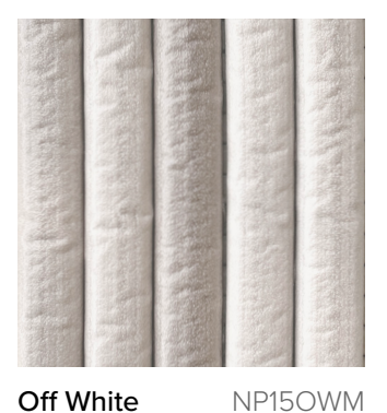
Off White Mushroom