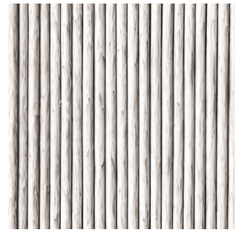
White Wash P3WW