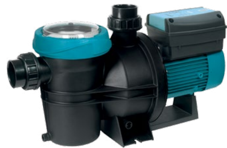
Silenplus 2M and 3M