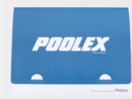
Maintenance kit including multi-language user manual