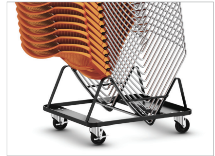
Stacks 25 to maximize space