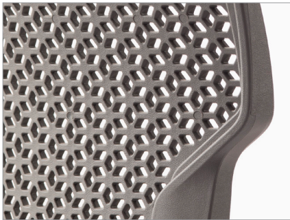
Airy and breathable