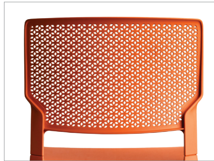
Extra-wide for extra support