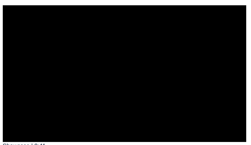
Showcase | 0:41 TL Seating

Specifications Dimensions: 24"W x 24"D x 39.87H" Seat Height: 17" - 20.75" Weight: 54 lbs / 24.49 kg Volume: 10.5 ft<sup>3</sup> / 0.29 m<sup>3</sup>